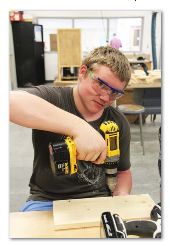
continued on page 24

The Behavioral Intervention Program (Bridges to Success) is a full-day program that provides an intensely supportive environment for students in grades 7-12. This program embeds social work, counseling and low student-to-adult ratios into a wrap-around service for students who are not identified as a student with a disability.